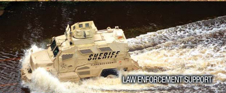
LAW ENFORCEMENT SUPPORT