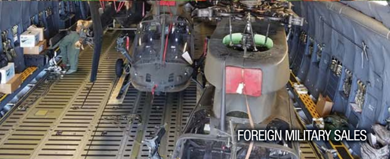
FOREIGN MILITARY SALES